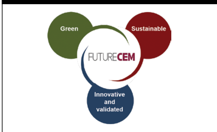
Figure 1: FUTURECEM™ – an innovative, validated solution for green and sustainable solutions

product with or without additions for concrete manufacturing.