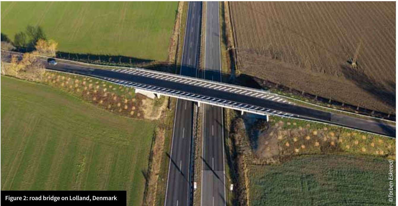
Figure 2: road bridge on Lolland, Denmark