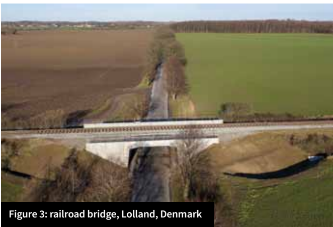
Figure 3: railroad bridge, Lolland, Denmark