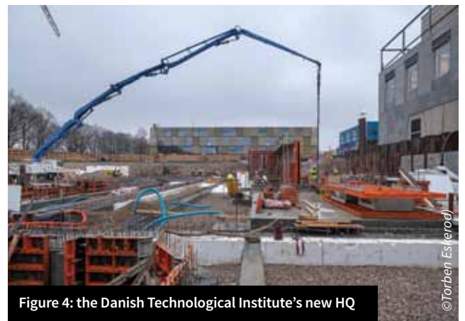
Figure 4: the Danish Technological Institute's new HQ