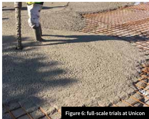
Figure 6: full-scale trials at Unicon

The Cementir Group is also participating as a main player in an international initiative promoted by the Global Cement and Concrete Association (GCCA): Innovandi – the Global Cement and Concrete Research Network. Innovandi ties together the cement and concrete industry with scientific institutions to drive and support global innovation with actionable research. Calcined clay is considered a key strategic technology and Cementir Group is leading the way. ■