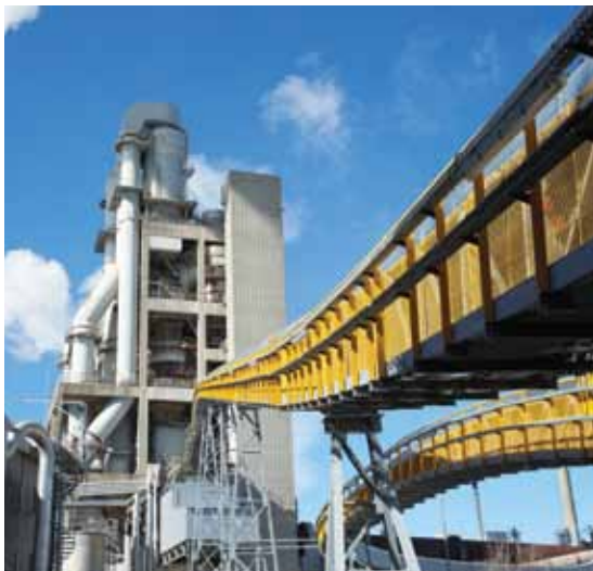
Figure 5: at Aalborg, Denmark, the aim is to market the first grey cement based on FUTURECEM™