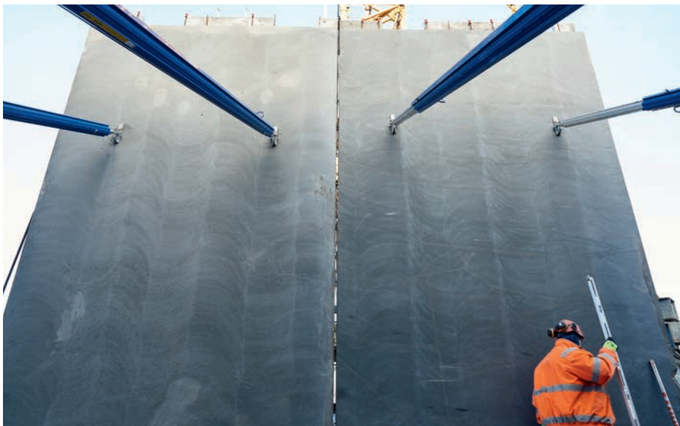
Concrete element walls that in the future can be cast with optimized cement.

- Our first test with FUTURECEM showed that the cement behaved